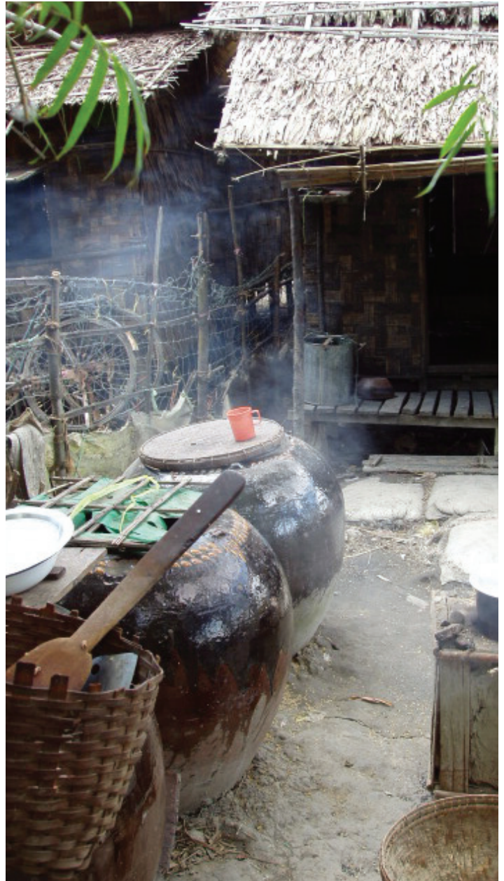
Pots of rice in Pyawbwegyi village.

cause of suffering, the cessation of suffering and walk the path that leads to the end of suffering, can we, like Saya Thetgyi, start to find a way out of the prisons of our minds.